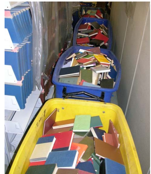
Part of the 4.5 tons of books & journals HSL recycled.

Another 60,000 volumes (or about 4.5 tons) of other materials will be converted to recycled office paper, cardboard and other products, thanks to a partnership between HSL and local recyclers.