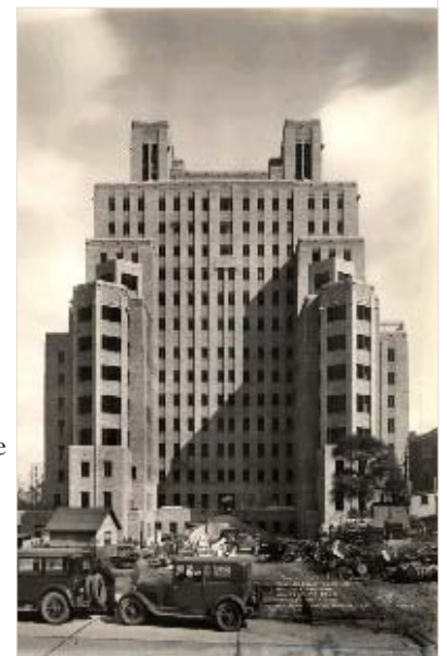
The Neurological Institute

A pictorial exhibit by Archives & Special Collections at the Health Sciences Library tells the story of the construction of the Neurological Institute building in 1925-1929 with vintage photographs and original documents. The structure remains the home of the neurological service of both the hospital and medical school. It is part of a series of exhibits celebrating the centennial of the NI.